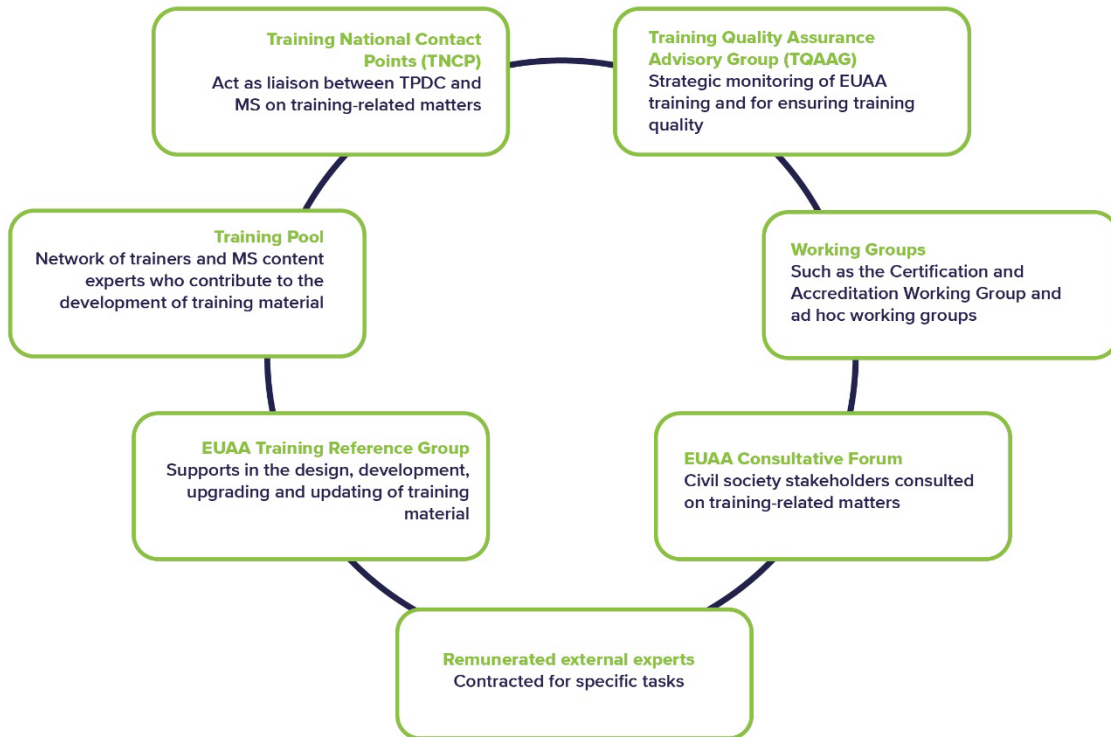
Figure 2: Advisory and working groups

A key strength of the EUAA’s approach to training is the inclusion of the expertise of the EU Member States and associated countries, which are the main beneficiaries of the training, across all processes relating to the design, development, delivery and evaluation of the EUAA’s training. As an organisation, the Agency fosters an open dialogue with civil society stakeholders through the Consultative Forum. In addition, there are further groups or panels of experts who work directly with the TPDC, as detailed in Figure 2 below.